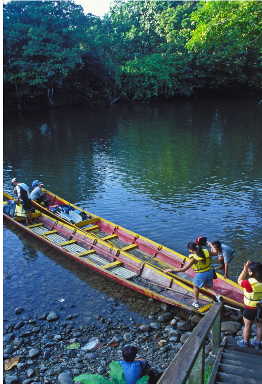
Boating at Ulu Temburong

Club management also oversees the operations of the other two courses in the country, namely Royal Brunei Golf and Country Club and Royal Brunei Airlines Golf Club. Golf tourism is