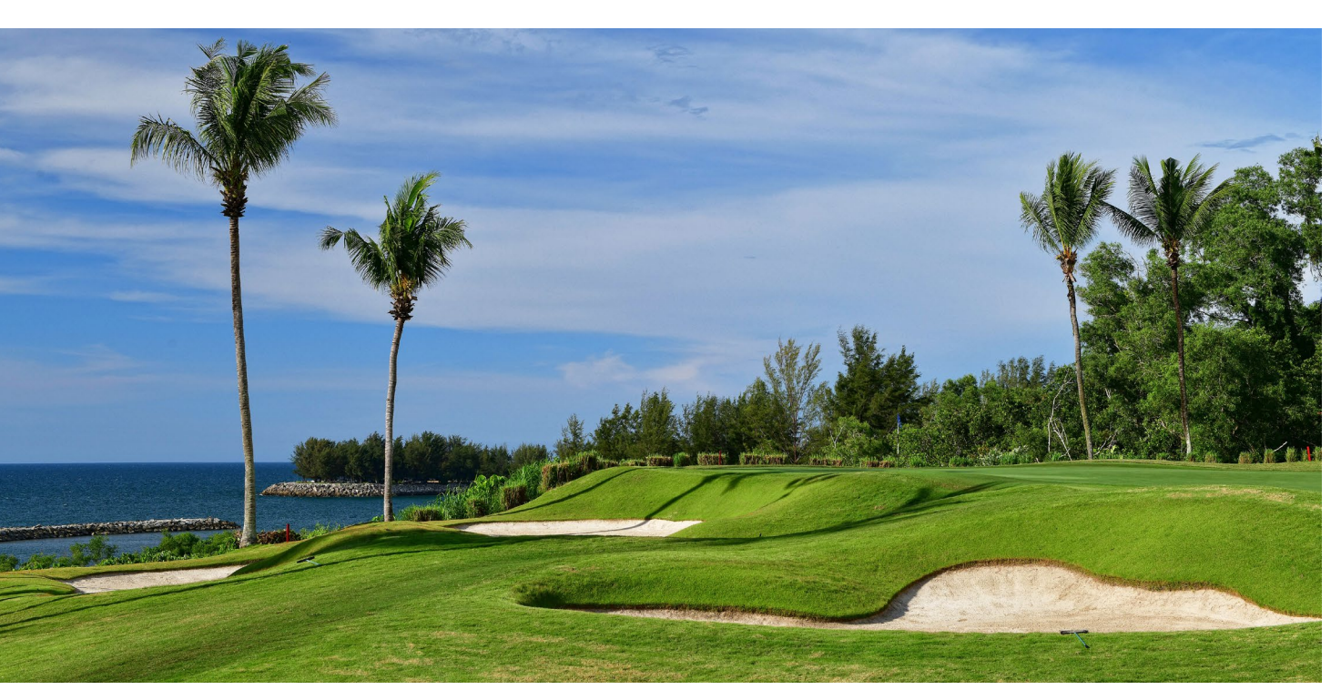
5th green at The Empire Brunei

The crowning glory in Brunei's eco-arsenal is the 50,000-hectare Ulu Temburong National Park. Visiting and